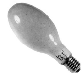
DSE or DSF lamp