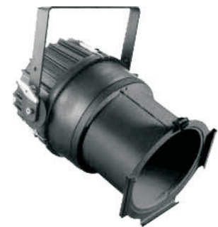
Outdoor-PARs with 8" snoot