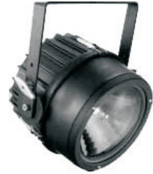
Outdoor-PAR64, OD-600-A StarPar, and ODC-A Outdoor CDM StarPar