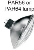
Link to PAR56 and PAR 64 data sheet