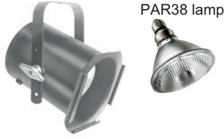
A-PAR38 Link to data sheet