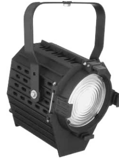
#1KAF 6" Fresnel Link to data sheet

6" lens Fresnel with die cast and extruded aluminum body for TV or theatre use. Produces a soft edge beam with a field angle from 12.2° to 70°. Has a rear located lever focus system. Includes a 7.5" x 7.5" color frame, safety screen, safety latch for accessories, 3' cord (no plug), and safety cable. Available with choice of 4 lamp sockets: medium prefocus socket for BTL-BTR lamps, G9.5 2 pin socket for use with GLC series lamps, HPL socket for use with HPL series lamps, or medium bi-post socket for use with EGT series lamps. UL, CE, and cUL listed for 1000 watts. Altman brand. Aprox. Weight is 18 lbs.